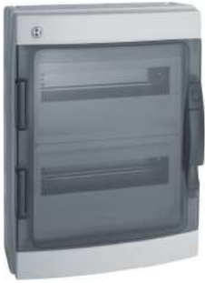
I I RQM